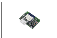
B74/BCONNECT Module Wi-Fi B-CONNECT - Management and programming system in IP and CLOUD web mode, via P2P hot spot Wi-Fi connection for 36V Brushless digital controller (B70/2ML - EDGE1 - CTRL - CTRL/P - B70/1DCHP).