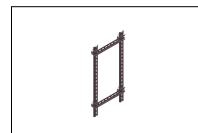
KT239 Kit DIN rail with magnetic support.