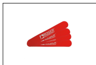
R99/BASB40 Pack of 40 stickers for barrier.