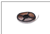
ALED/12C Luminous led cord of 12 meters with connection cable for boom arms.