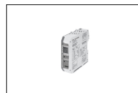
DLD2/24 Loop detector for 2 loop, 2 output + output alarm, 24V AC/DC.