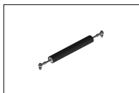
SP/83/01 Spring diameter 83 mm for barriers.