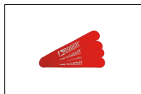
R99/BASB20 Pack of 20 stickers for barrier.