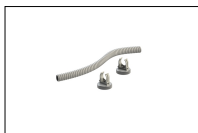
KT242 Cable passage kit with magnetic support for barriers.